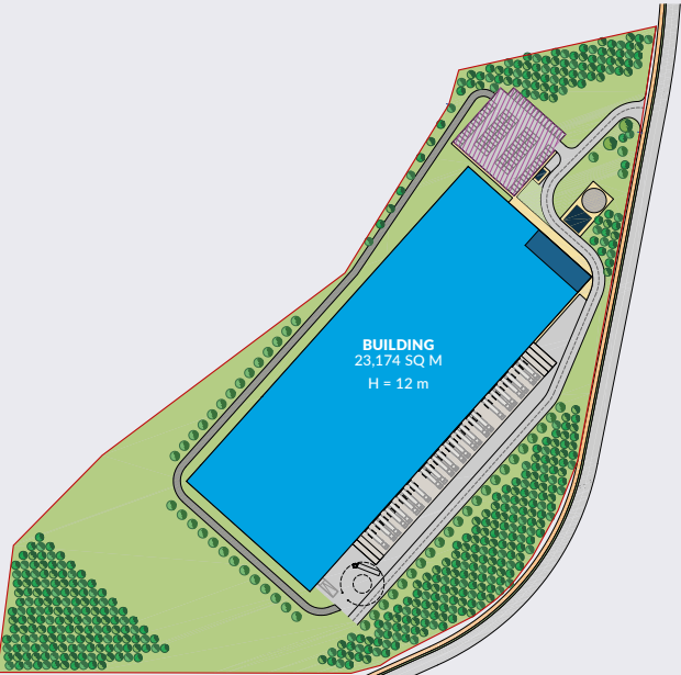
Indicative site plan