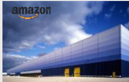
UK RUGELEY 65,000 SQ M EXISTING BUILDING