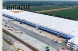
GERMANY HAMBURG 130,000 SQ M BTS LEASE: 20 YEARS