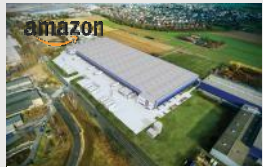
GERMANY DÜSSELDORF 30,000 SQ M BTS