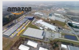
GERMANY MANNHEIM 10,000 SQ M BTS