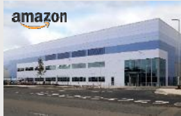
UK DAVENTRY 27,600 SQ M EXISTING BUILDING LEASE: 15 YEARS